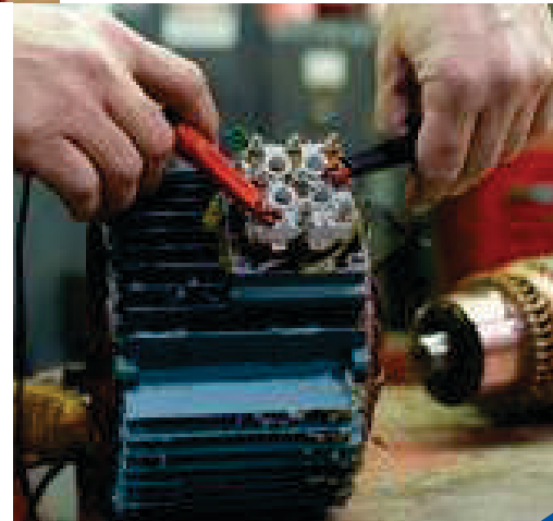
Electrical Motor Repair

Q UANTUM FIRST AUTOMATION INC An ISO 9001:2015 Company