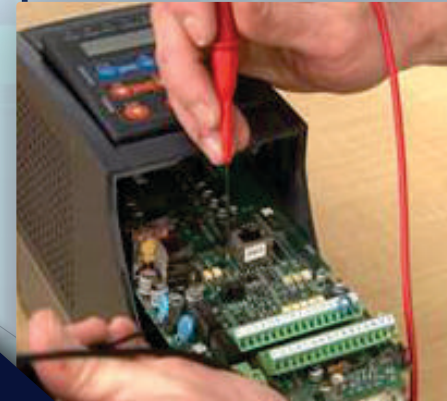
AC Drive Repair